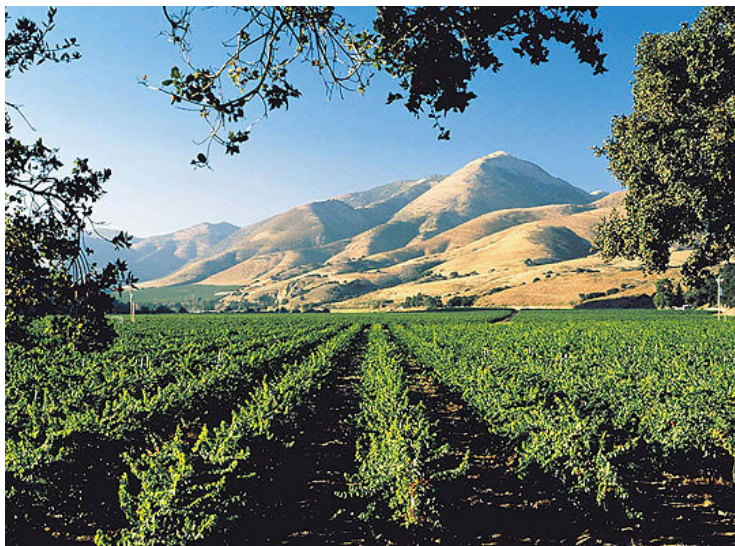
On the second Saturday of each month, the Santa Maria Valley Wine Country will offer free walking tours of vineyards like Bien Nacido Vineyards.

Tour North County vineyards and meet the people who grow the grapes and make the wine